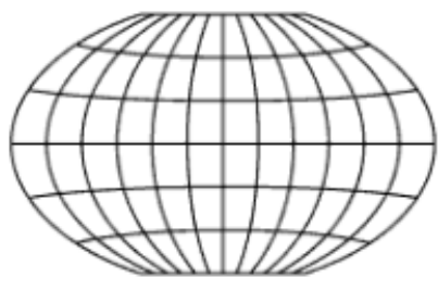
Winkle a compromise projection used by many mapmakers today.

??? 1. What is the projection of the world map you are using? ______ Is it shown above? _____